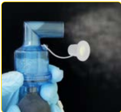
You should see a fine mist