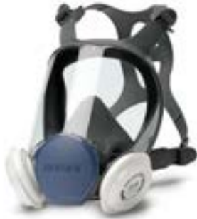
Full Face Mask

Please note full face masks cannot be Fit Tested with Qualitative Fit Test kits.