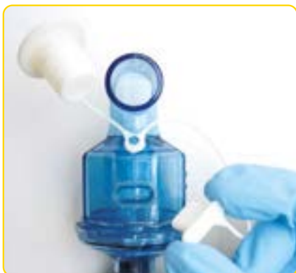
Make sure caps are removed