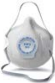
Filtering Facepiece (FFP)

Moldex make three types of tight fitting facepieces.